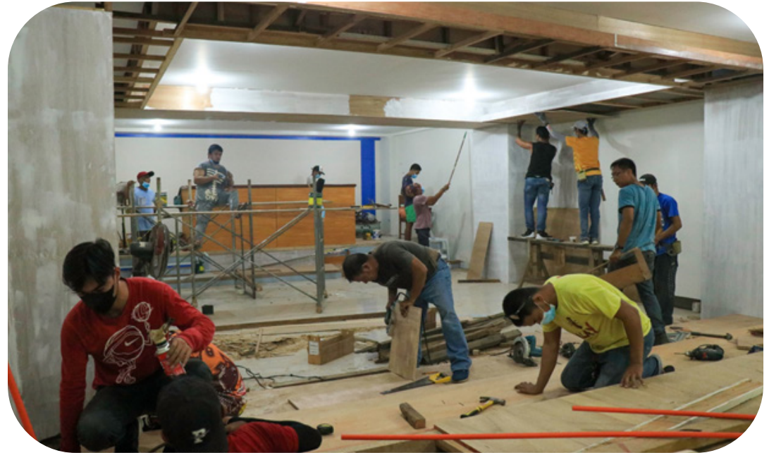
ON THE GRIND. Workers are on the move of crafting and grinding the moot court of Catanduanes State University, one of the requirements to offer Juris Doctor program under the College of Law.

po ang nagrespond positively sa satuyang feasibility study na requirement nin law board," the President highlighted, underscoring the feasibility and demand for the law program.