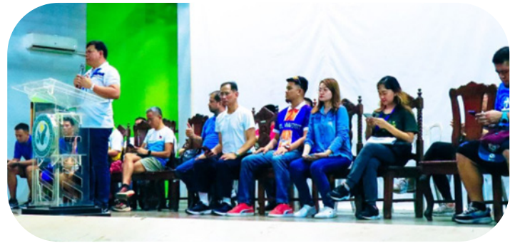
SOLIDARITY MEETING. Sports officials from various universities across the country convene at National SCUAA.

About 5, 000 student-athletes along with coaches, trainers, and sports coordinators are expected to participate in the grand opening.