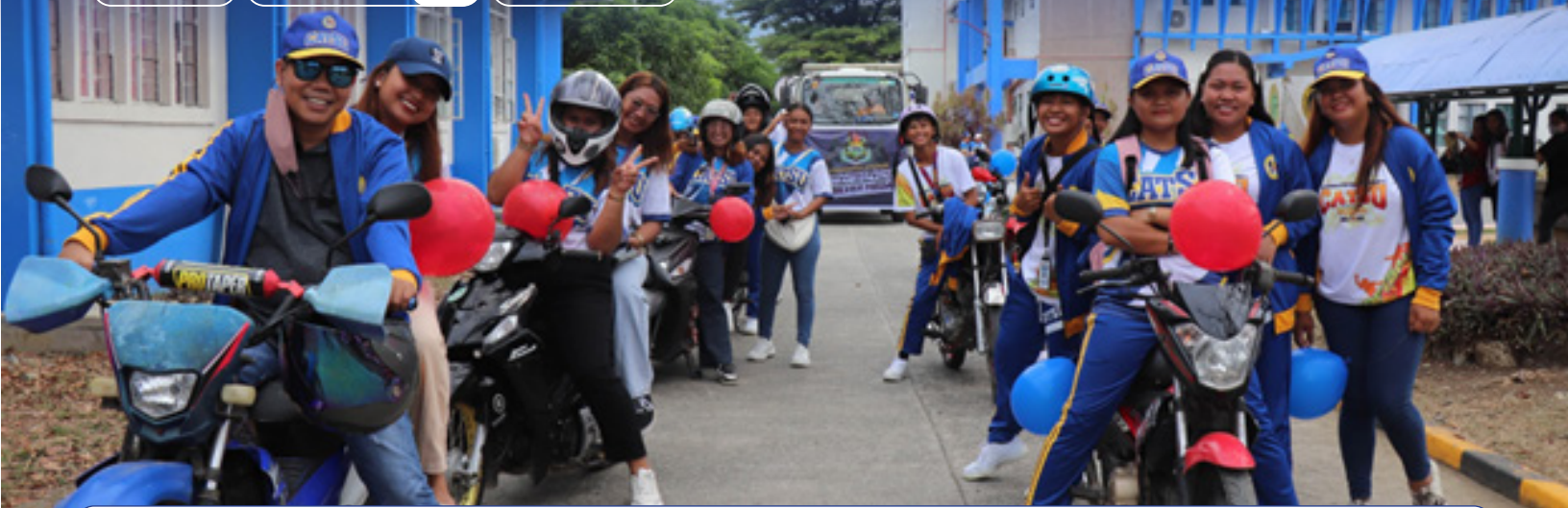
A SMILE OF A CHAMP. CatSU student-athletes are all smiles as they pose for the camera during the motorcade honoring their impressive feat at the regional SCUAA.