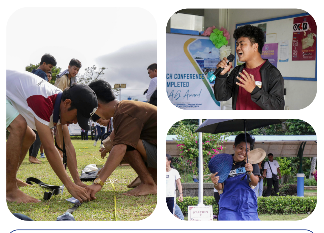
FUN-FILLED ACADEMIC BREAK. After completing midterms, students were able to unwind and participate in college-sponsored events during the university's charter anniversary in October.

The events were organized by the different college student councils, through the University Student Council and the Office of Student Affairs and Development Services.