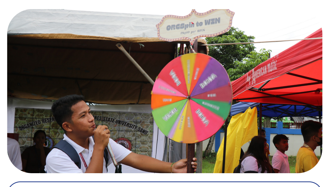
LUCKY SPIN. A CatSU student is attempting to get Php10 cash prize in the game ORCSpin to WIN while holding a wheel bar.

The two-day activity kicked off on October 23, and run October 24, as part of CatSU's 11th Charter Anniversary.