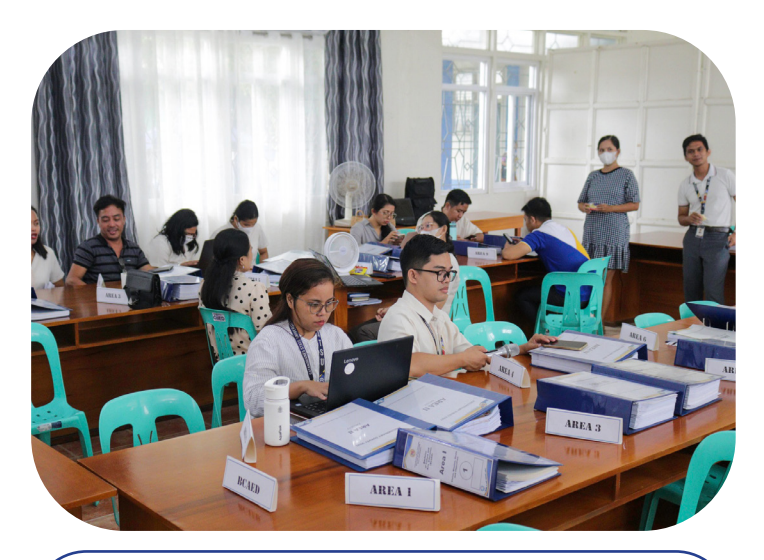
UNDER PRESSURE. COEd faculty gathered in the accreditation room to prepare necessary documents for evaluation of their college's curricular programs by accreditors.

The Accrediting Agency of Chartered Colleges and Universities in the Philippines (AACCUP) preliminary survey visit commenced on Monday, October 2, at the Accreditation Room of Catanduanes State University.