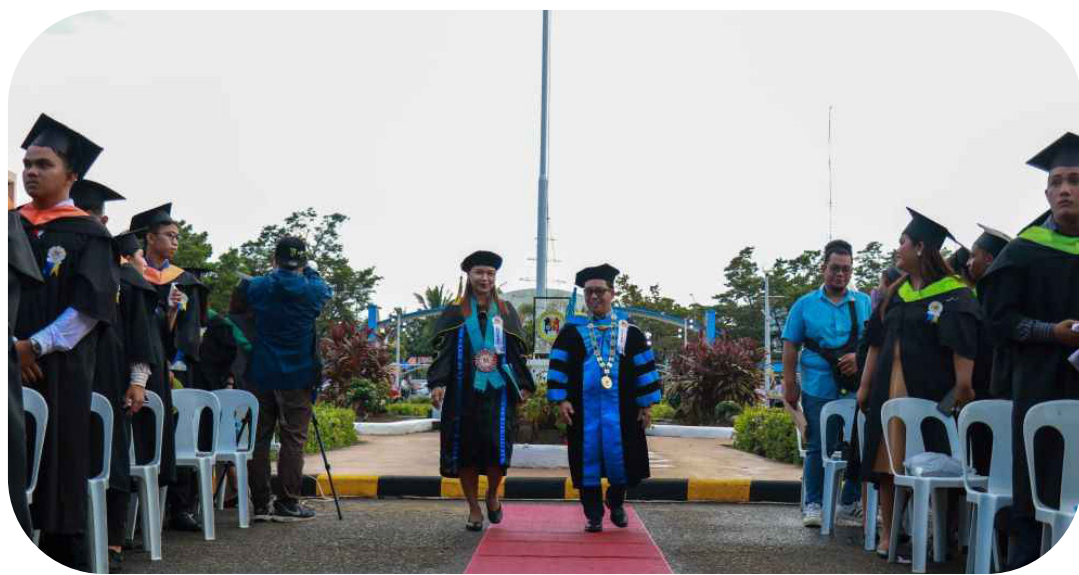
'LOOK BEYOND THE CLOUDY SKIES'. Catanduanes State University (CatSU) students ignore the wet weather as they stand firmly under a gloomy sky in front of the University Main building to attend 52nd Commencement Exercises on Tuesday, July 11.

mapakaray mga naraot, yu iba mairinuman ngani, at palaging may pag-asa. This is a positive attitude that you can infuse in your first job," he implored the graduates of the College of Engineering and Architecture, College of Sciences, College